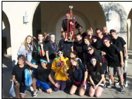
Congratulations to Chokoloskee Church of God Youth Group who won 3rd place at the Florida Youth Leadership Association games with a total of 11 awards.

Snook Classified is only $10 per issue ... Phone 695-2397 or email us.