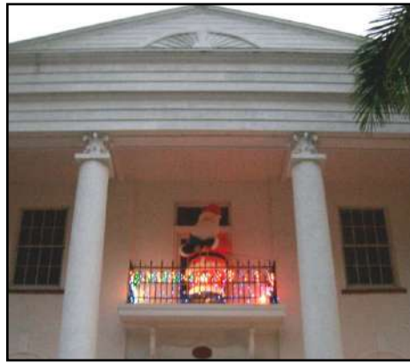
Santa is watching from the balcony of City Hall to see who is naughty or nice.

Snook Classified is only $10 per issue ... Phone 695-2397 or email us.