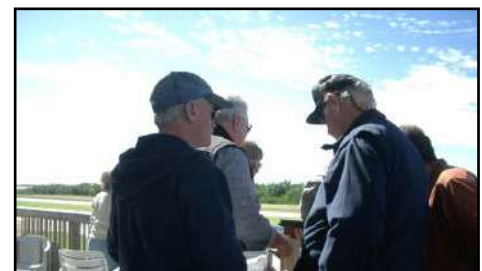
Airplane aficionados enjoyed the chat & the pancakes at the Airport Fly-In. See page 3.