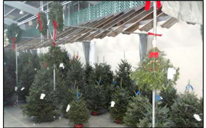
Christmas Trees are now on sale Fridays through Sunday at Big Cypress Market Place just south of CR-951 on the Trail.