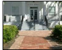
Buy a brick for Christmas! The Everglades Society for Historic Preservation is accepting orders for engraved commemorative bricks that will be laid in the path leading up to City Hall. The campaign closes on February 28. Order forms are available at City Hall and on www.evergladeshistorical.org .

Volunteers from Everglades Community Church spent countless hours creating a total of 761 little pillows which were included in holiday packages for soldiers in Iraq and Afghanistan to give them "a piece of home".