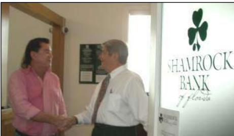
A branch of the Shamrock Bank opened in City Hall (3/20/09).