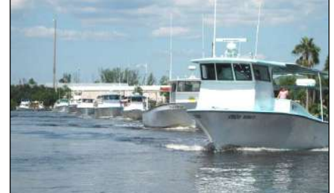
The blessing of the crab fleet took place at the Rod & Gun before the season started (10/16/09).