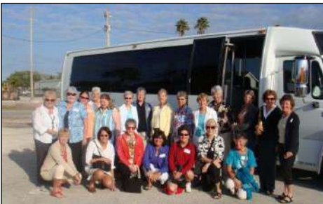
A group from Ladies' Coffee took a bus trip to Miami (3/20/09).