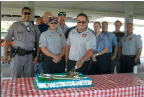
A community BBQ was held to thank our emergency workers (5/15/09).