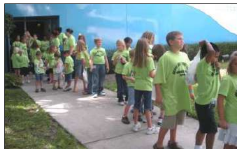
A group of Reach Out summer campers went to Wannado City (7/24/09).