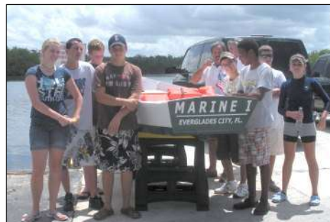
Local youngsters took part in the CCSO "Build-a-Boat" project (8/21/09).