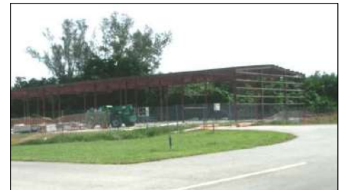
New hangars at the Everglades Airpark were almost finished (11/13/09).