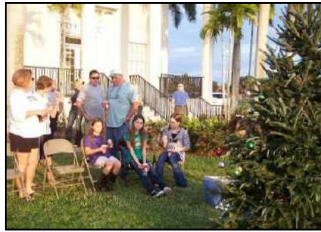
The Christmas Tree in front of City Hall was decorated on December 11 by children of all ages who enjoyed cookies & punch after the work was done.