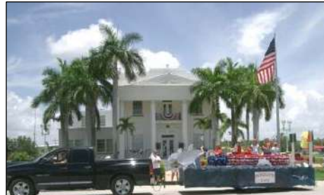
The Independence Day parade had beautifully decorated floats (7/10/09).