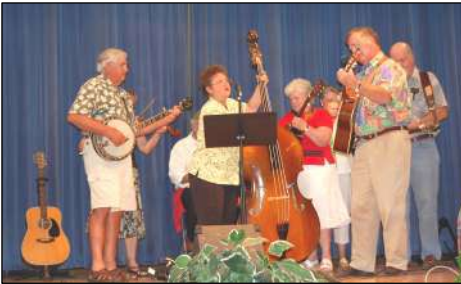
Local performers played at a music festival at the school (3/6/09).