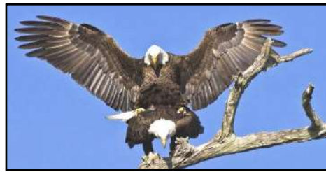
The Bald Eagles have built their nest at the Fakahatchee Boardwalk. See our Park Activities on page 10.