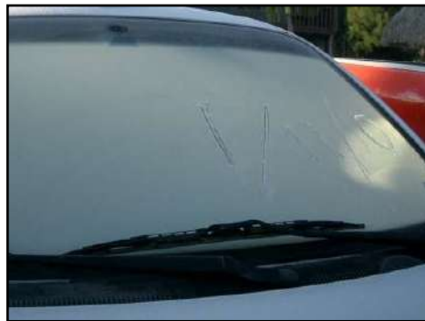
Yes, we had frost on January 11. The temperature in ECity was down to 28°F early in the morning.