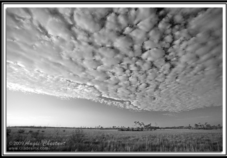
early in the morning along the Tamiami Trail. For more of her work, see www.GladesPix.com.