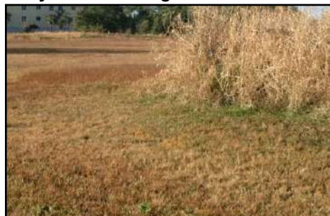
Grass and plants in the area are brown from the very cold weather.