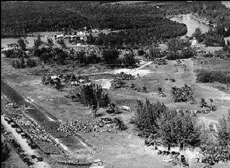
ECity Airpark in 1947 at opening of Everglades National Park, photo courtesy of Florida State Archives.