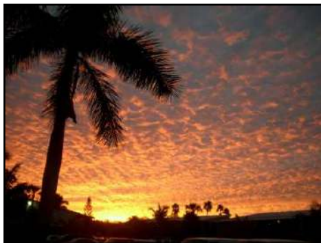
The early bird catches the sunrise which can be spectacular in January.