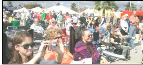
Smiles at our Festival despite the dark sky.