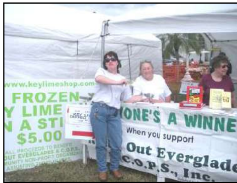
Chocolate-Covered Frozen Key Lime Pies, a favorite at Seafood Festival, were sold by volunteers at Reach Out, our neighbor charity.

Snook Classified is only $10 per issue ... Phone 695-2397 or email us.