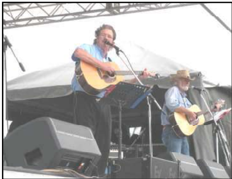
Most people agree that Seafood Festival didn't have as many visitors in 2010 as in previous years but the music was great.