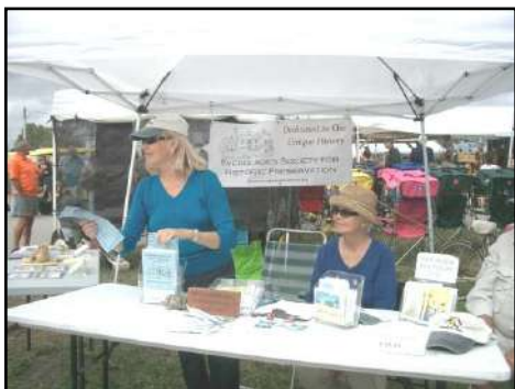
Volunteers at the ESHP booth handed out order forms for engraved pavers to be laid in front of City Hall. The DEADLINE to return your order is February 28. Forms are available at City Hall or at www.evergladeshistorical.org or by phone at 695-2905.