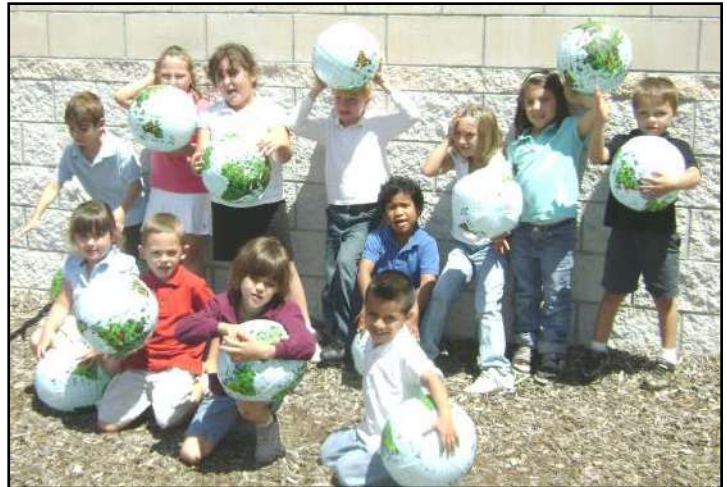
To help celebrate the 40 th anniversary of Earth Day, Pre-K and Kindergarten spent some time collecting trash around the school campus. According to Ms. Ryan, they collected 14 pounds of trash.