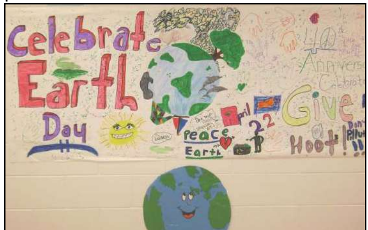
Some students from 4 th , 5 th , and 6 th grade classes worked collectively to make an Earth Day banner and posters describing helpful hints on how to preserve energy and help keep the Earth clean.

THANKS TO TRINA MITCHELL FOR PHOTOS AND REPORTS