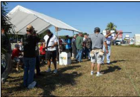
The Annual Turkey Shoot sponsored by the Lion's Club on the weekend of February 7/8 raised over $5,000.