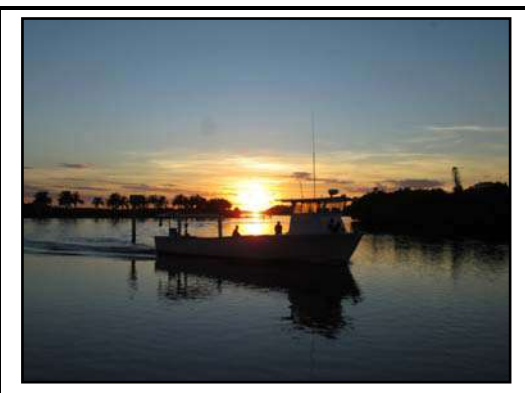
Crab Boat at Sunset Photo by Linda Walfield - November 7