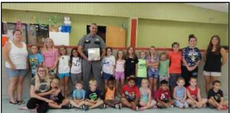
Children and volunteers at the Reach Out Everglades Summer Camp. 7/31/15