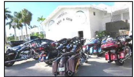
Over 60 members of the Gulf Thunder Riders (from Port Charlotte) & friends enjoyed lunch at the Rod & Gun. These motorcycle enthusiasts come from Canada, NY, and all over the U.S., some visiting as early as 1965.