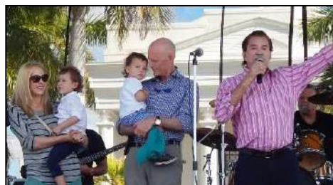
Gov. Scott and family visited the Everglades Seafood Festival. 2/13/15