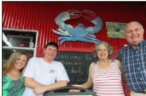
The Whichello family held a Golden Lion Motor Inn reunion in Ochopee. 5/8/15