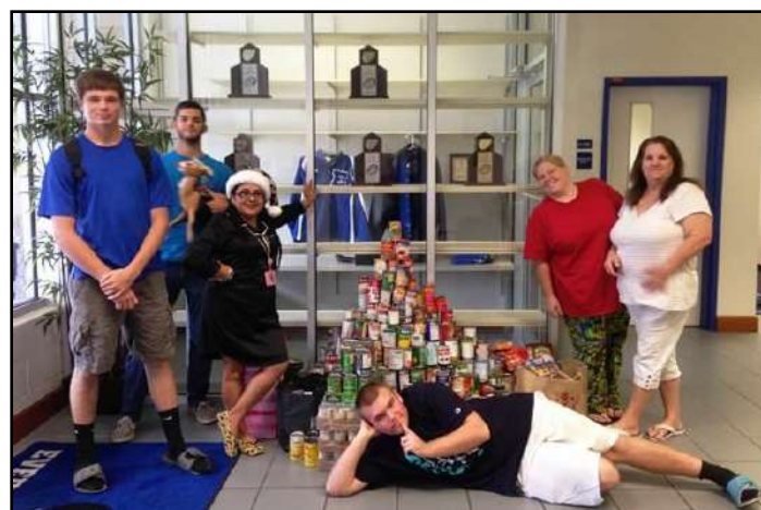
Students and staff with the food collected by Everglades City School for The Harry Chapin Food bank.

picture taken and pick a couple of gifts from Santa's bag of toys. They also received an official certificate showing they made Santa's "Nice List" and will receive a letter from Santa.