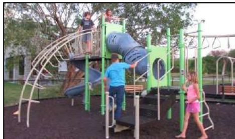
Youngsters enjoy the new playground at Chokoloskee Church of God. 4/10/15