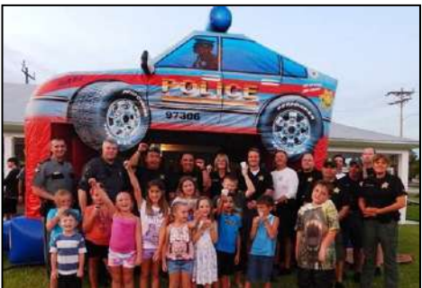
The community enjoyed Hot Summer Nights hosted by CCSO. 7/17/15