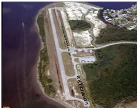
The extension of the south taxiway at Everglades Airpark was completed. 1/2/15