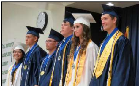
Students graduated from Everglades City High School. 6/5/15