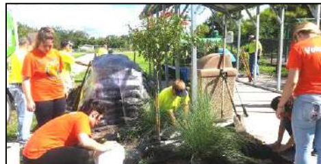
Marco Sunshine Rotary Club landscaped two new bus shelters in Copeland. 9/25/15