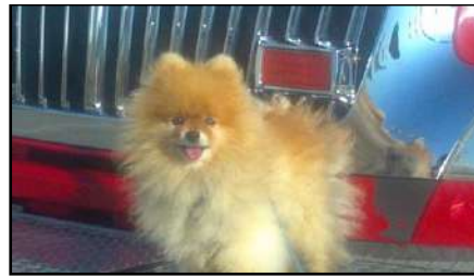
The Swishers submitted this photo of "Fozzie out and about in Everglades City"