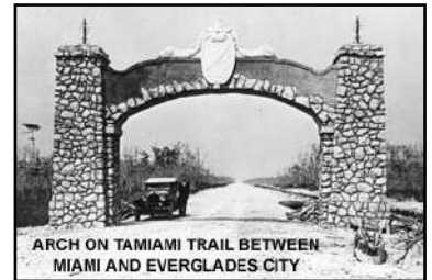
ARCH ON TAMIAMI TRAIL BETWEEN MIAMI AND EVERGLADES CITY

For more information, please visit www.colliermuseums.com or call 239-695-0008. This year's event is sponsored by the Friends of the Everglades Museum.