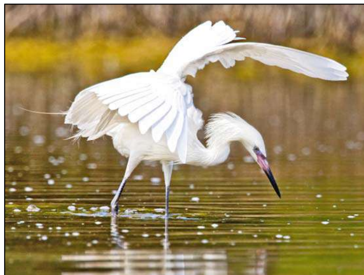
Reddish Egret, White Morph

If you plan to head into some of the tidal rivers in this area, it's a good idea to carry a reliable hand-held GPS for navigation, as well as plenty of fresh water, insect spray, and rain gear. After a while every mangrove island and mangrove-covered point looks exactly the same as the last one, and finding your way out might turn out to be a lot harder than finding your way in.