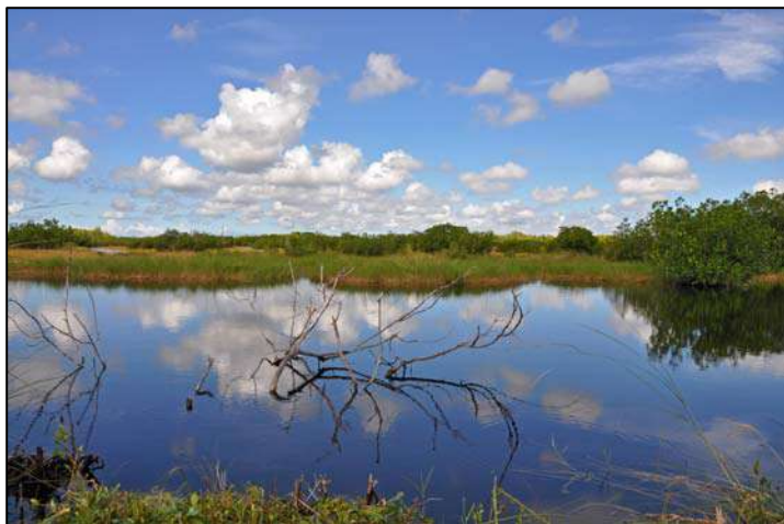
Marsh Trail View

of the largest unbroken mangrove forest in North America, bordered to the west by the 110,000-acre Rookery Bay and to the east by the 1.5-million-acre Everglades National Park. This forest is comprised of predominantly red mangroves, or “the walking trees” as they are sometimes called, but also has black, white, and buttonwood mangroves. All of these trees have the capacity to flourish in brackish or saltwater environments.