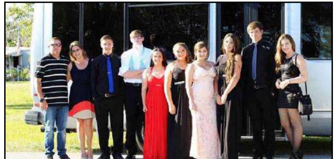
The group mugs for the camera before the nights' activities in Marco Island