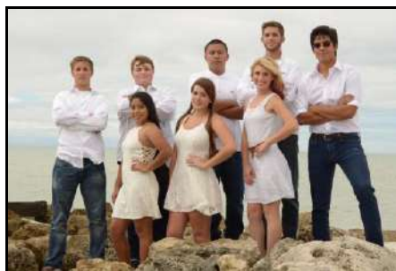
Graduating Class of 2016 (More Graduation News on Page 9)