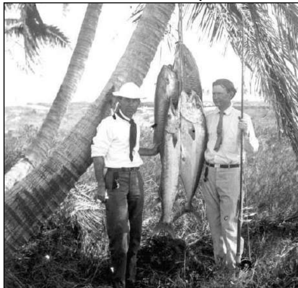
photo: Zane Grey and brother in 1916

Zane Grey is known for his westerns but his first love was fishing. He often visited Florida and wrote about his forays into the watery wilderness in Tales of Southern Rivers which was published in 1924 (reviewed in the Rapper , 11/21/14). In the chapter about the Everglades, he describes the Seminoles that he saw and the shell mounds on Chokoloskee and Fakahatchee Island.