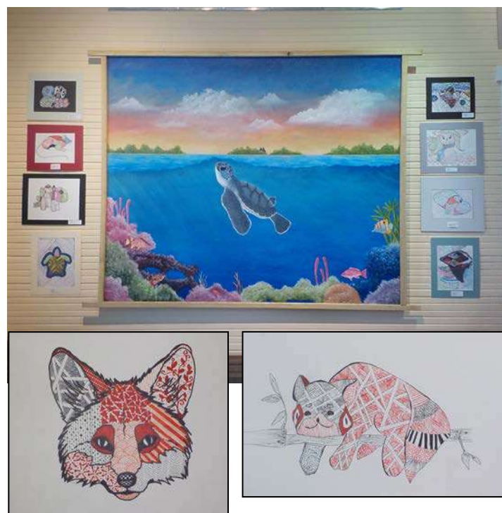
Above: Student Artwork on Display at E-City Museum Located at: 105 Broadway Ave W, Everglades City, FL 34139