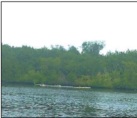
Barrier set up by investigators around fire-damaged vessel.

Law enforcement was called to the scene of a fire-damaged vessel on the morning on August 7 th . The incident is being investigated as a possible arson. The location of the fire was on the west side of Barron River behind Triad Seafood. There were no reported injuries. The vessel was completely destroyed.