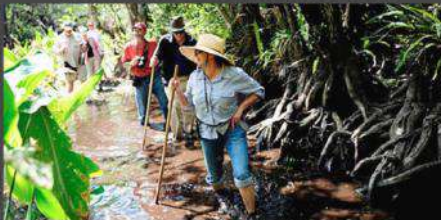
Behind Big Cypress Gallery