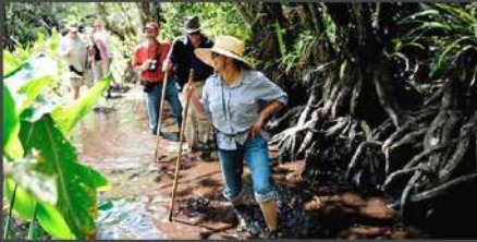
Behind Big Cypress Gallery