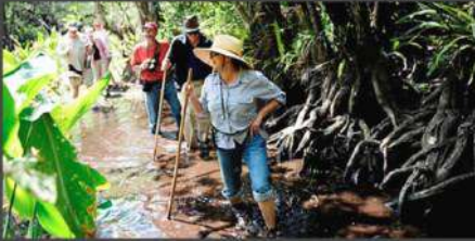
Behind Big Cypress Gallery