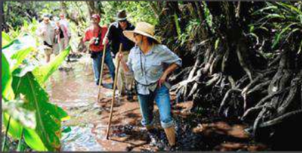
Behind Big Cypress Gallery