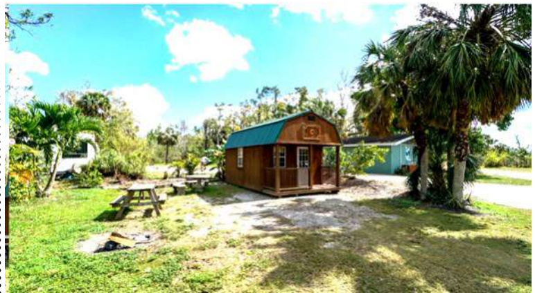
RV Slip, Cabin, & Bath House at Trail Lakes Campground