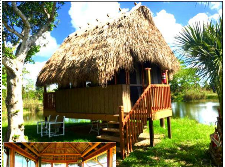
Native Chickee Hut Camping & Kayak Tours Await!