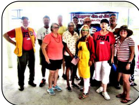
Photo Left: The Everglades Lions Club gets together to prepare the free lunch to those in attendance. In total, over 250 hotdogs, chips and beverages were served. Great job done by the Lions Club!

2240 DAVIS BOULEVARD • NAPLES, FLORIDA 34104 email: debbiemoshiertrucks@icloud.com web: debbiemoshierinternationalusedtruckcenter.com