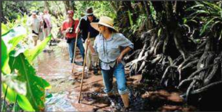
Behind Big Cypress Gallery