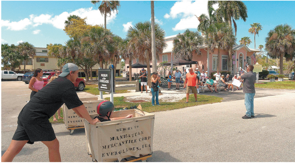
Parents and their children get ready for the laundry cart race.