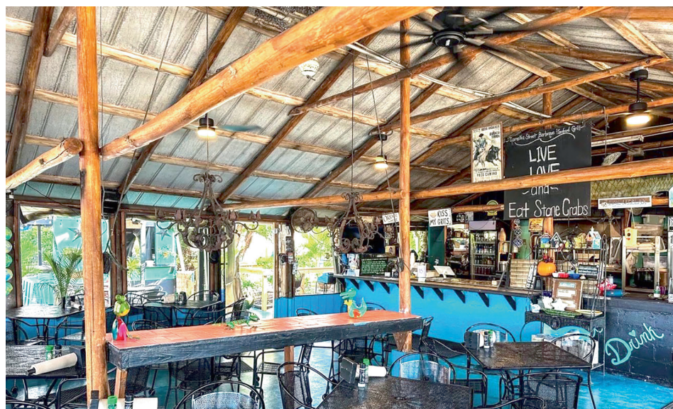
Camillia Street Grill.

Stone Crabber here in Everglades City. He started his own business and calls his boat $till Trappen. The stone crabs he catches each day get cooked at the fish house and then brought over to Camellia Street Grill to sell on the menu! Stone crabs are a delicacy down here, and Everglades City is known as the "Stone Crab Capital of the World!" Going out on the boat seven days a week and leaving for work at 3:00 AM is rough, especially when you don't know if it is going to be a good haul for that day. Some days he can come back with 300 lbs. of Stone Crab claws and then there are other days where it can be as low as 100 lbs. But no matter what gets thrown his way, he always ends the day incredibly thankful for everything. My family has worked hard for all that we have, and it is not easy owning three businesses. I am proud to have a family filled with hard-working individuals I can look up to and be inspired by. I cannot wait for the day that I can take over and continue our generational businesses!