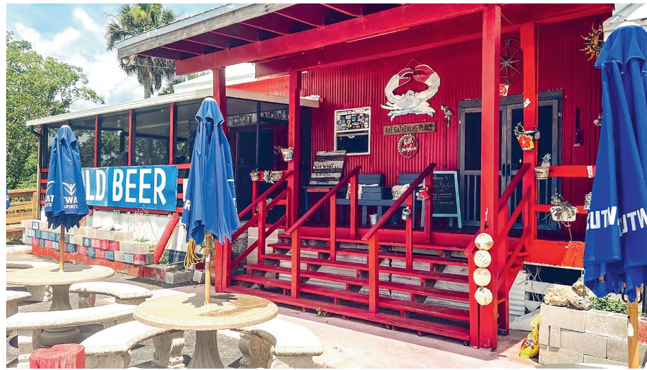
Joanie's Blue Crab Cafe.

mom (Naiara Rementeria-Freeman) took over Camellia Street Grill. Both restaurants were passed down a generation and eventually, when I'm older, my mom Naiara will take over Joanie's Blue Crab Café, and I will take over Camellia Street Grill!