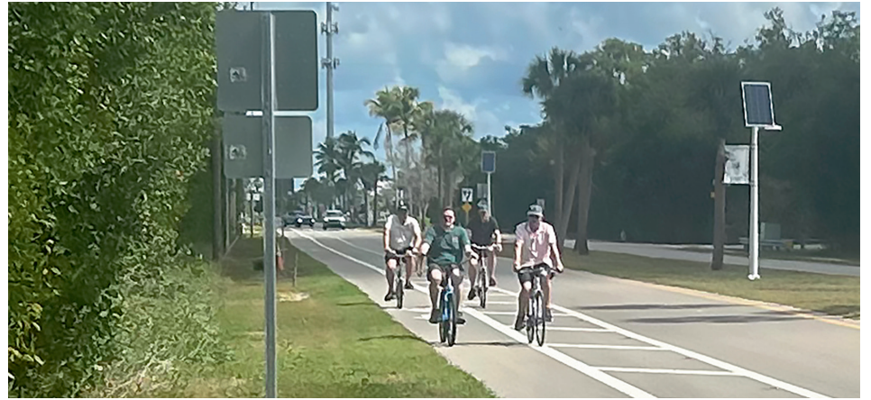
These four pilots from the UK made use of bicycles provided by Friends of the Everglades Airpark. They flew into Miami and rented planes to fly to the Annual Fun and Sun Event in Lakeland. On their way back to Miami, they flew into Everglades Airpark to see Everglades City and have lunch at one of our local restaurants.

repairs. In the interim, the Aviation Community is making good use of the Everglades Airpark. The Friends of the Everglades Airpark have made a difference in promoting the continued use of operations there. We have provided bicycles for the Pilots to have a means to explore the amenities of Everglades City.